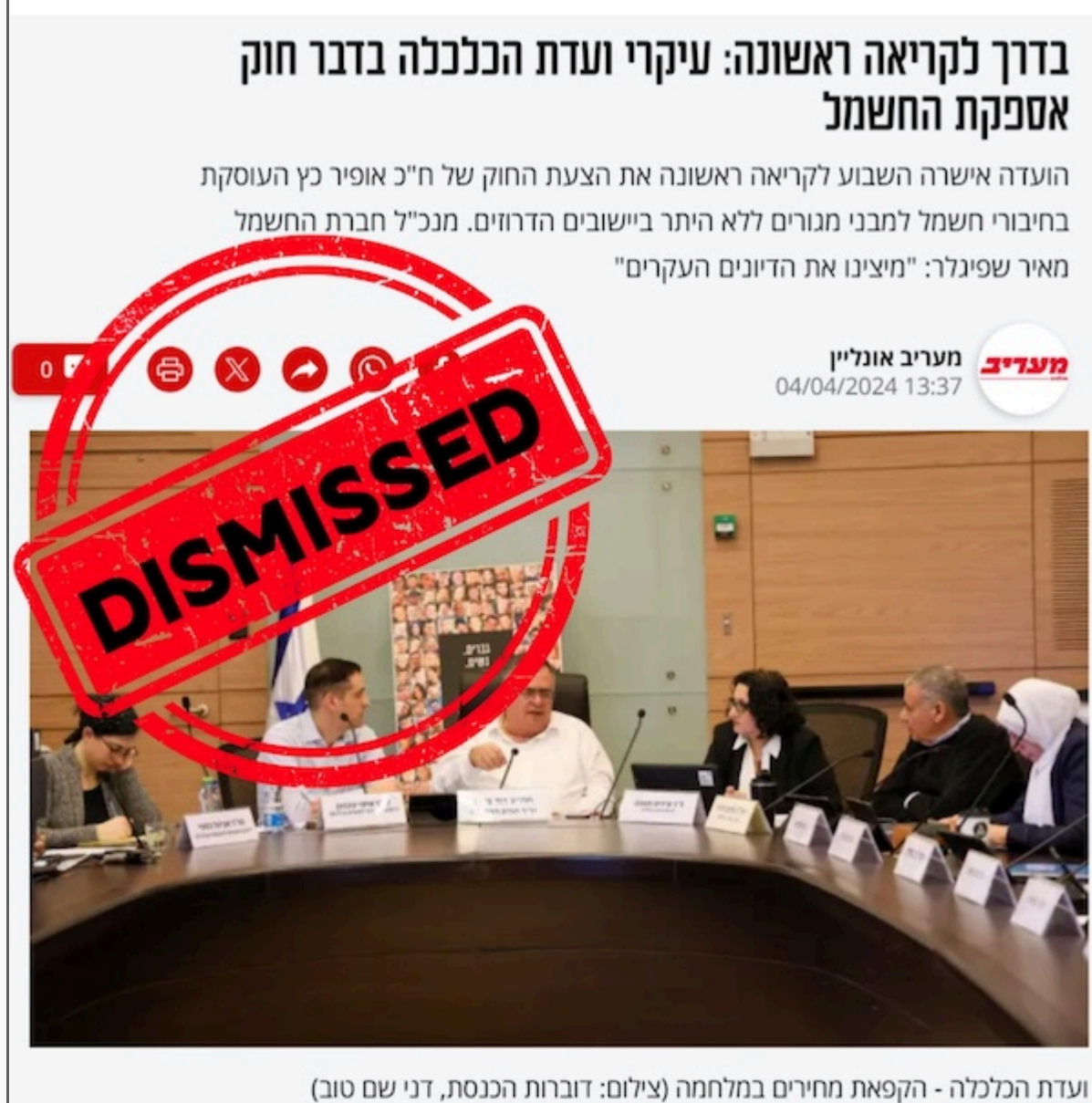
ועדת הכלכלה - הקפאת מחירים במלחמה

Due to the outbreak of the war on October 7, Regavim's 2023 Annual Report was put on hold – but we're pleased and proud to share it with you at long last. It recaps a year packed with activity that was interrupted by on October 7 th , when the entire Regavim Team was called to duty on all fronts. Read - and share!>>